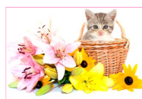
Easter Lilies (cats only)